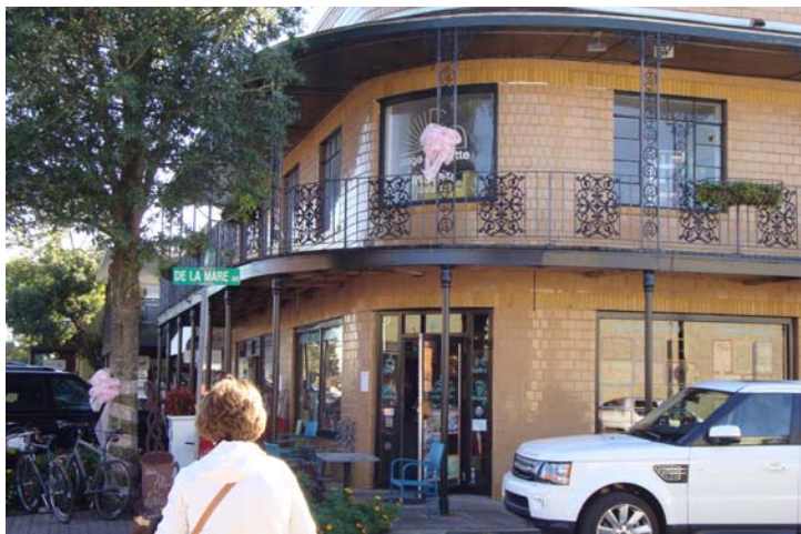
Page and Palette, bookstore where Andy unexpectedly encounters Jones, the Noticer.