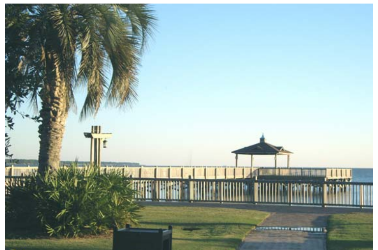
Gazebo-like structure where "the phenomenon" takes place -- one can learn much