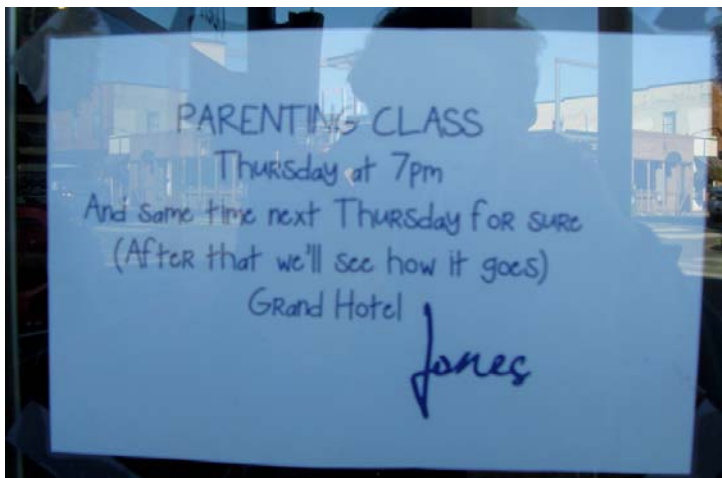
Sign in the window of Page and Palette referred to in the book.